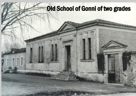
Old School of Gonni of two grades

Initially, one was of the four-level classes type and the other was a two level type. It was located south of the central square of the village. The 4 grades school was