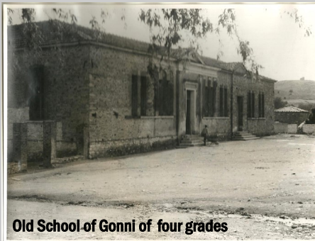
Old School of Gonni of four grades

west of the main road of the village. The two-grade school was east of the road. With time and for school needs, the necessary extensions were made. All this pre-war. During the Occupation and Resistance, the buildings, archives and teaching material were destroyed in 1943. That's why there are not many data for this period (especially for the period 1943-1947).